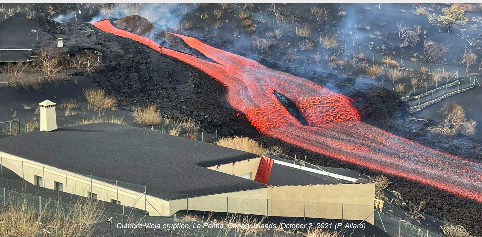
Cumbre Vieja eruption, La Palma, Canary Islands, October 2, 2021 (P. Allard)

© 2021 International Association of Volcanology and Chemistry of the Earth's Interior, https://www.iavceivolcano.org/