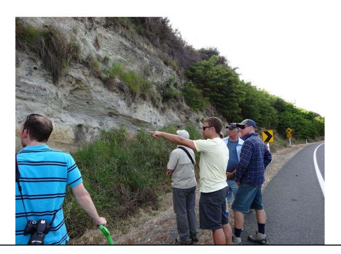
From top to bottom : Group at top of Tarawera; Group at 1886 Tarawera Fissure; Group at old tephra section in Taupo)