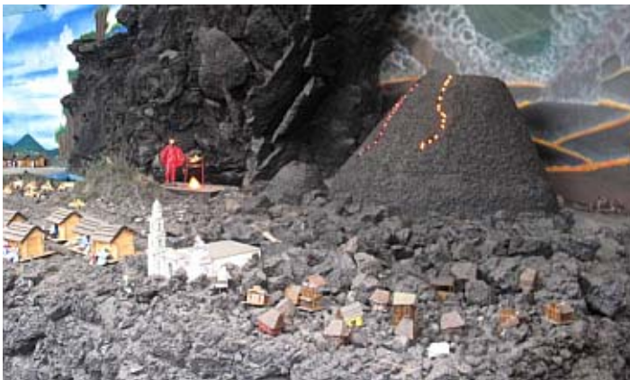
Outside the re-creation of the church destroyed by Paricutin at San Juan Nuevo, this model is a less than subtle reminder to visitors of the destructive events of the eruption. When activated, the model also lights up to show the devil moving, rotating a local farmer on the spit over a fiery fountain of lava. Murals inside the church also bear graphic testament to the impacts of the eruption on the local population (S. Cronin).

Our creaking bones were restored by the final fiesta of the meeting, with a fantastic Mariachi band, some impromptu Torero action and a lot of dancing. Most of the group bid their farewells at this point, with a sub-group of c. 25 carrying out a further three-day excursion to the deposits of Jorullo.