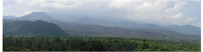
Between 1943 and 1952 lava flows from Paricutin (L background) buried the former towns of Paricutin and San Juan Parangaricutiro, 2 and 4 km away from the scoria cone, respectively. The upper floor and tower of the church is all that remains at San Juan (at far right) (Jan Lindsay).