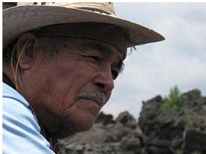
In the ruins of the church of San Juan Parangaricutiro an eyewitness to the eruptions describes to the group what it was like to see his surroundings engulfed by lava from Paricutin.

The final day of the field trip was one that all who participated will long remember! Three hours of exciting horse riding to the base of the Paricutin cone, followed by a short jaunt up its steep slopes, enabled the group to view the broad extent and variety of lava flow and pyroclastic products of this eruption, as well as see the combination of both monogenic cones and small