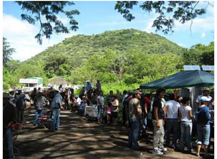
Volcán Jorullo, its 250 years of peace shattered by birthday celebrations at its foot involving 70 volcano scientists from around the world and around a thousand members of the local community.

Over 70 delegates travelled to the beautiful city of Morelia, central Mexico from 27 September to 4 October 2009 to celebrate the 250th anniversary of the "birth" of Volcán Jorullo in Michoacán and to exchange knowledge on the current state of understanding of monogenetic volcanism. Despite the